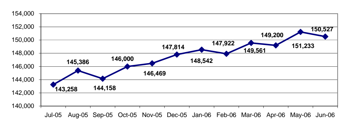
Figure 3: Recipients in Singles (SNA Non MOE) Cases July 2005 to June 2006

By contrast, Figure 3 shows the recipient count for "traditional" Safety Net Assistance (SNA) cases, usually referred to as "singles" cases since they consist primarily of one-person adult cases. The number of recipients in this category increased by 7,269, from 143,258 to 150,527, or 5.1%. This increase is approximately one-quarter of that observed in the year previous to the report period.