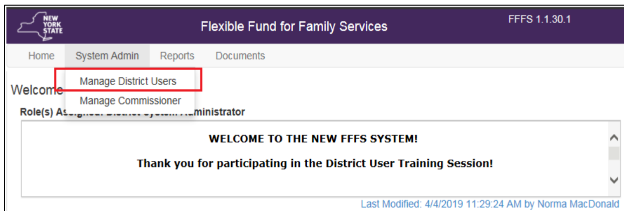
Figure 2: Tab selection from the Navigation Bar

To view District Users, click the System Admin tab located in the Navigation Bar and select the Manage District Users tab.