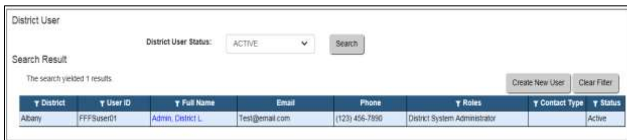
Figure 3: Sample District User Screen

The system displays the District User screen. A new user can be added or the details of an existing user can be modified.