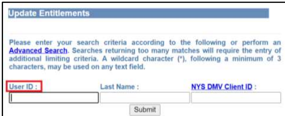
Figure 9: Search User Screen

Search for the user that needs entitlement to BEPS.