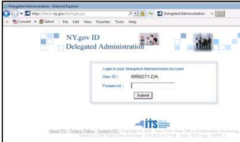
Figure 8: Delegated Administration site

Log in to the Delegated Administration site.