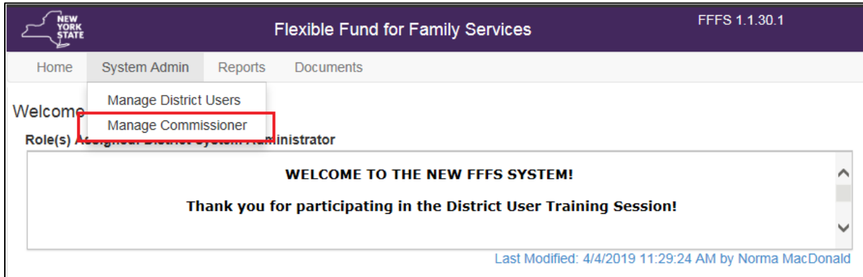
Figure 6: Tab selection from the Navigation Bar

To view the Commissioner information, click the System Admin tab located in the Navigation Bar and select the Manage Commissioner tab.